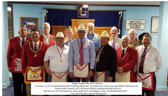
Borger Chapter Officers for 2018-19