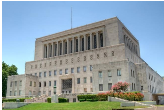
Fort Worth Masonic Temple 1100 Henderson Street, Fort Worth Texas

Past Grand Master of the Grand Council of RSM Texas