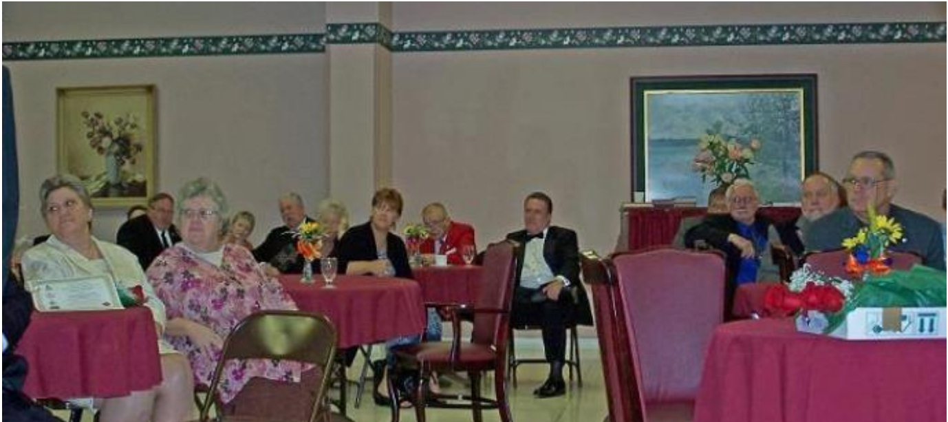
Here are some 2007 pictures, we had about a hundred in attendance honoring the Worshipful Masters.

Here are some pictures of past events honoring the WM's.