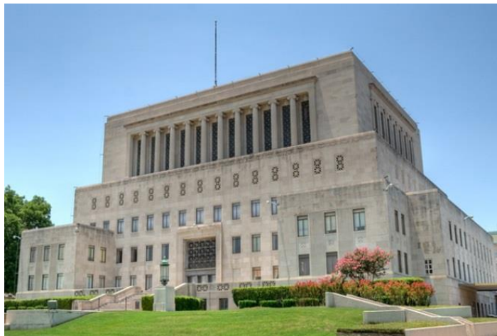
Fort Worth Temple 1100 Henderson Street, Fort Worth, Texas